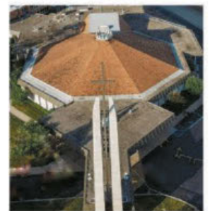
STM Church Roofing Project